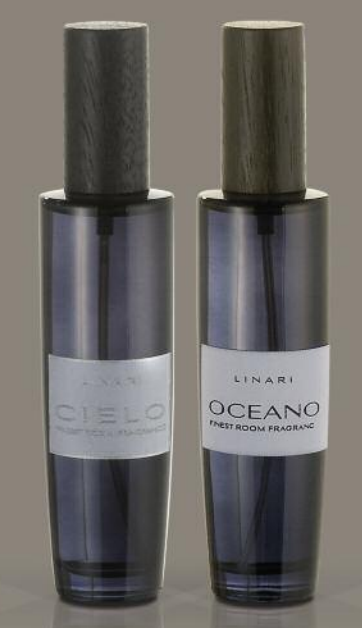
BLACK AMETHYST LINE