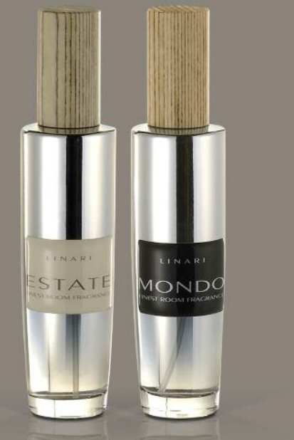
CHROME SHADOW LINE